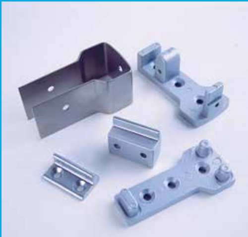
Cast aluminum brackets mount easily and allow simple removal of the mullion for full use of the opening.

Color matched security clips provide an added level of security overcoming the natural twisting of the door stile under pressure.