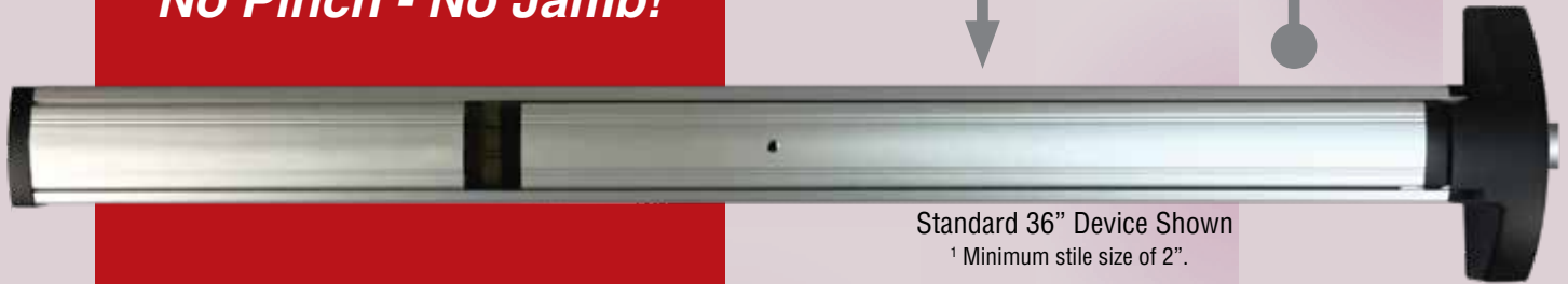
Standard 36" Device Shown 1 Minimum stile size of 2".

For widths less than 36" Consult Factory